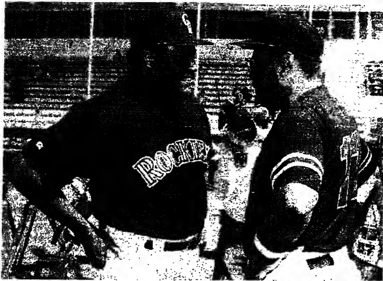
Colorado's Don Baylor, left, enjoyed a chat with another rookie manager, San Francisco's Dusty Baker, in Tucson, Arizona, before Baylor's expansion team gave him an even more enjoyable 7-2 victory in its debut. The Rockies scored four times in the third, on one hit.